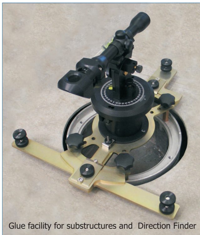
Glue facility for substructures and Direction Finder